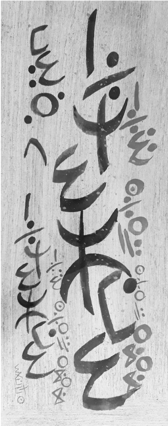
Ĝerĝer d Lewras Yiwēn Imaziyen d arraw-im SMAIL METMATI